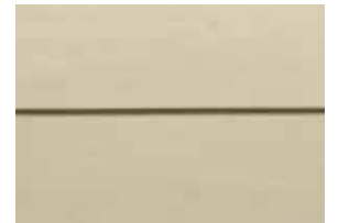
Smooth (white only)