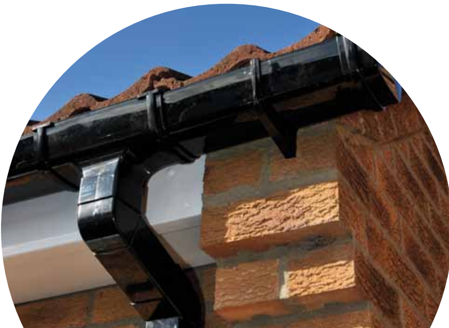
Ogee gutter with square fallpipe

Gutters are available in either half round, square or ogee decorative profile, with fallpipes either round or square. To ensure co-ordination with other roofline products they are available in black, white or brown.