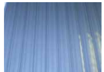
Bronze / Opal Polycarbonate