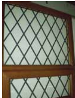
Diamond Leaded Glass (Obscure)