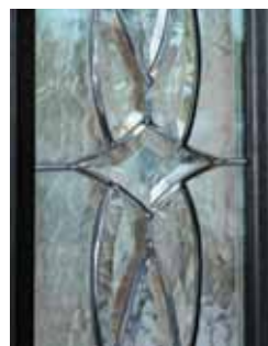
Bevelled / Leaded Glass