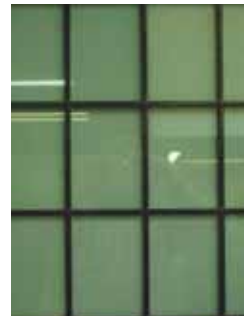
Square Leaded Glass