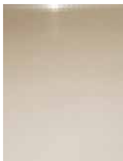
Bronze Tinted Glass