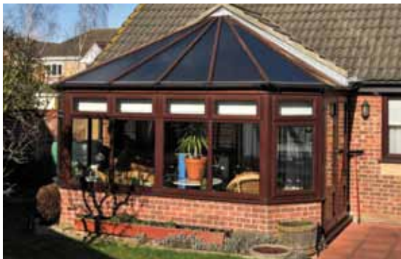
3 Segment Victorian