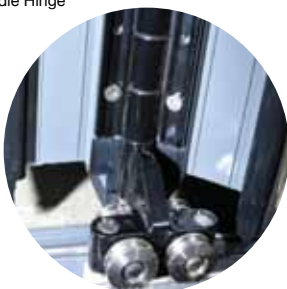
Bottom Wheels & Guides